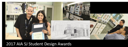
2017 AIA SJ Student Design Awards

This is a free event, but your RSVP is required